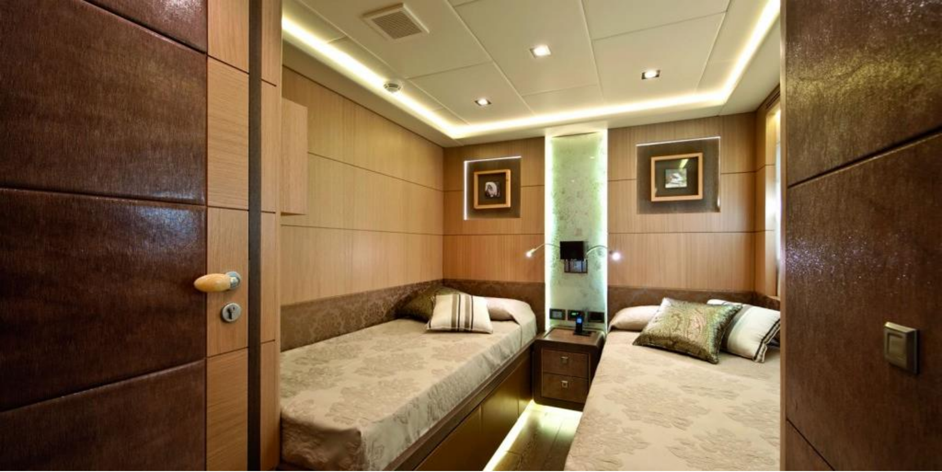
ONE OF THE TWIN BED STATEROOMS