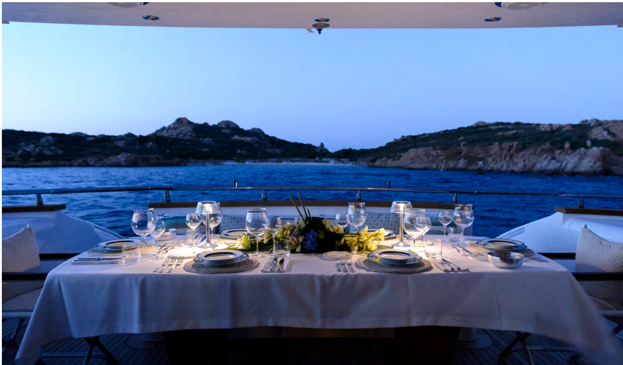
MAIN AFT DECK | AL FRESCO DINING