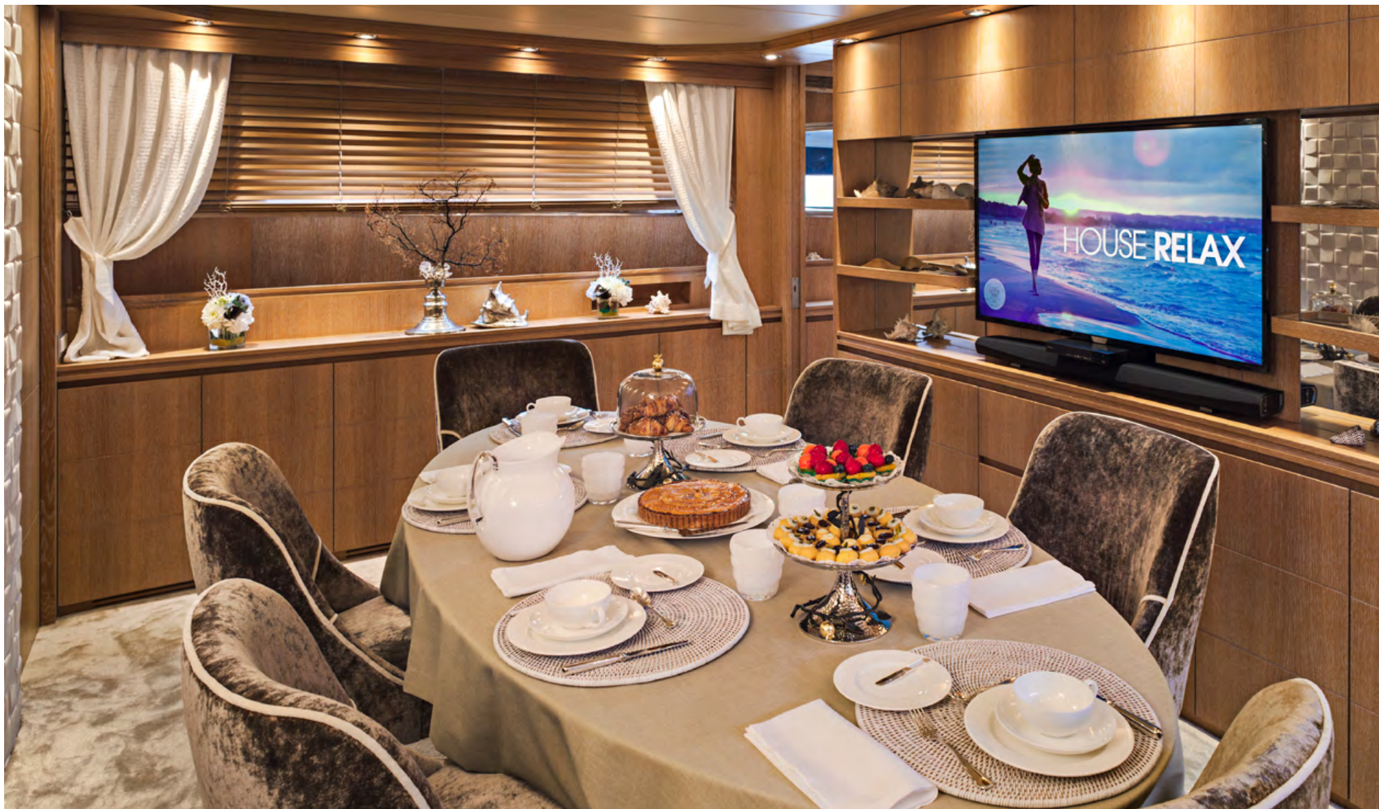
MAIN DECK | FORMAL DINING