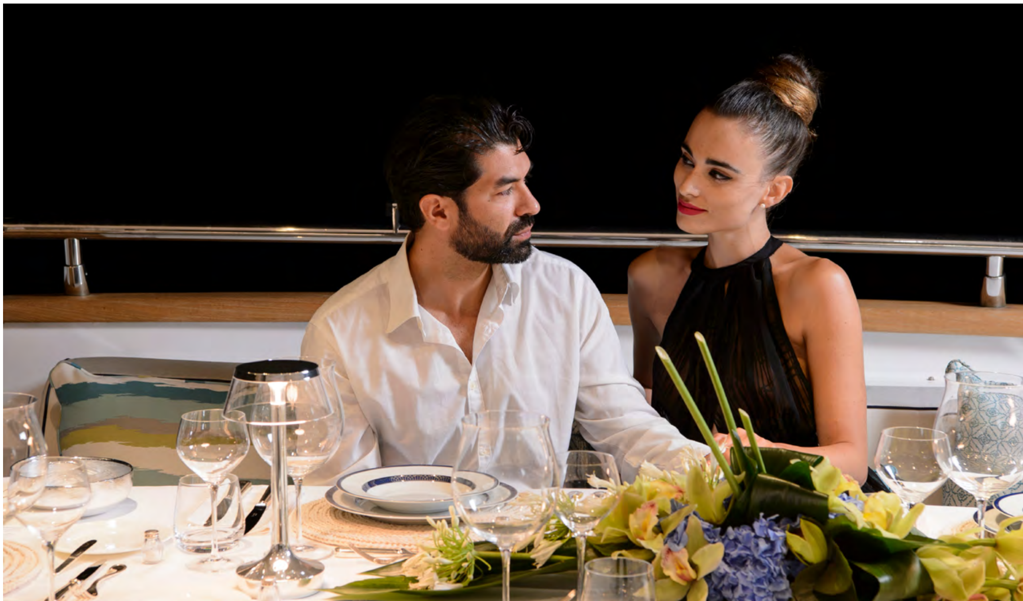
MAIN AFT DECK | LIFESTYLE