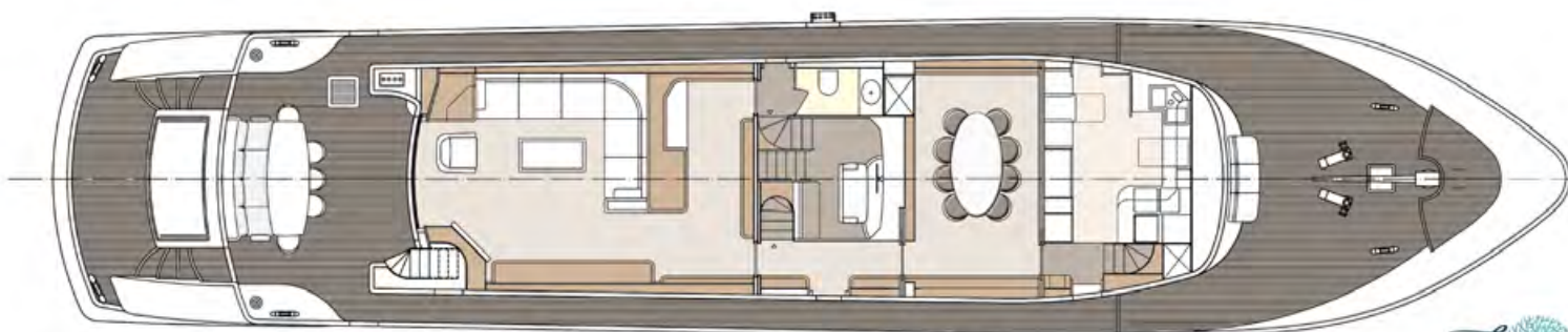
MAIORA 31: MAIN DECK PLAN (SC. 1/50)